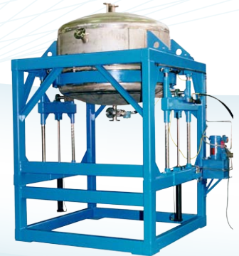
Quick Opening Bottom Closure with Variable Elevation Shell

ASME Section VIII, China Code (SQL-AQSIQ), European- PED (97/23/EC) | ISO9001:2008