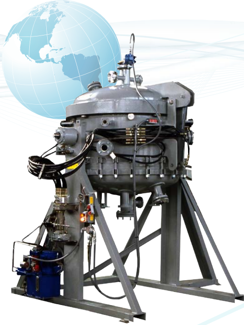
Durco Filters Pressure Nutsche with Hydraulic Top Opening & Tilt

Durco Filters Pressure Nutsches are ideal for piloting of new or modified batch operation and/or processes requiring recovery of process solids as dry or wet cake.