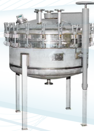
Vertical Top Opening with Hand-wheel Lift and Bolted Top Closure