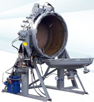
Bolted and Hinged Top with Pivoting Shell for Dumping Cake

Pressure Nutsche special designs to meet your exact requirements.